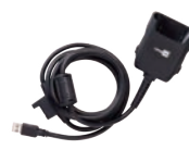
Snap-on cable (USB / RS232)