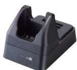
Charging and communication cradle