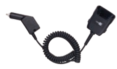
Snap-on car charger