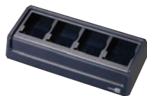
4-slot battery charger